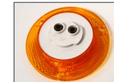
B142-49 PL10 Plug & B162-093 Clip