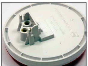
B431-491 PL3 Plug