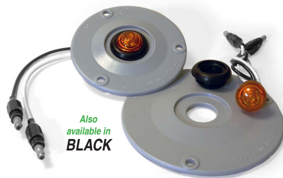
Also available in BLACK

Retrofits 176 series single-diode lights into existing mounting holes. Mounts with 3 rivets (recommended) or screws. Terminated with .180 bullets.