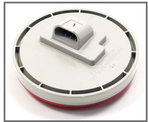
B417-49 Hardshell Plug