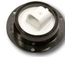
B192-492 Hardshell Plug